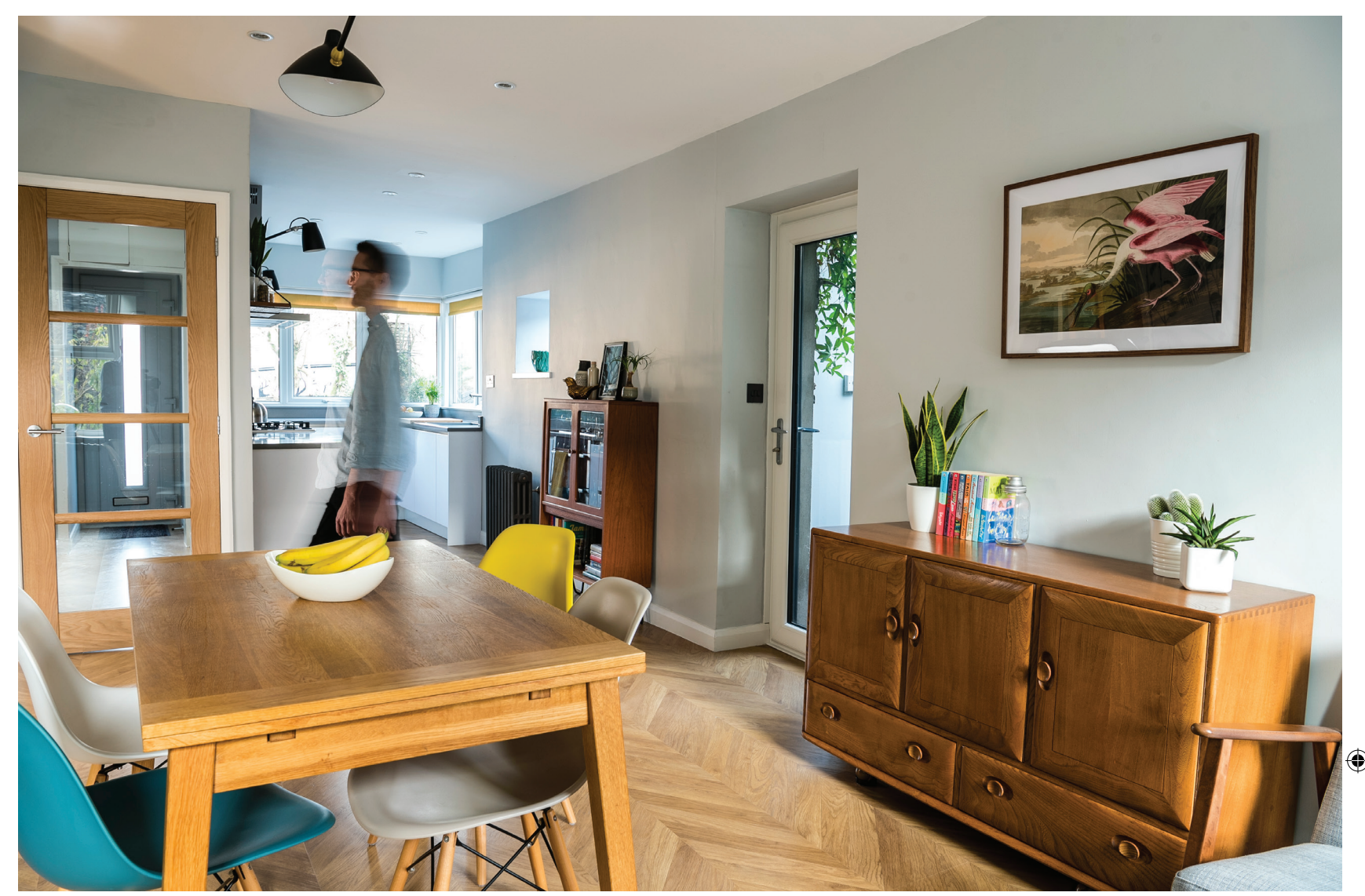
The dining room has a strong mid-century look and features a beautifully made vintage Ercol sideboard bought online