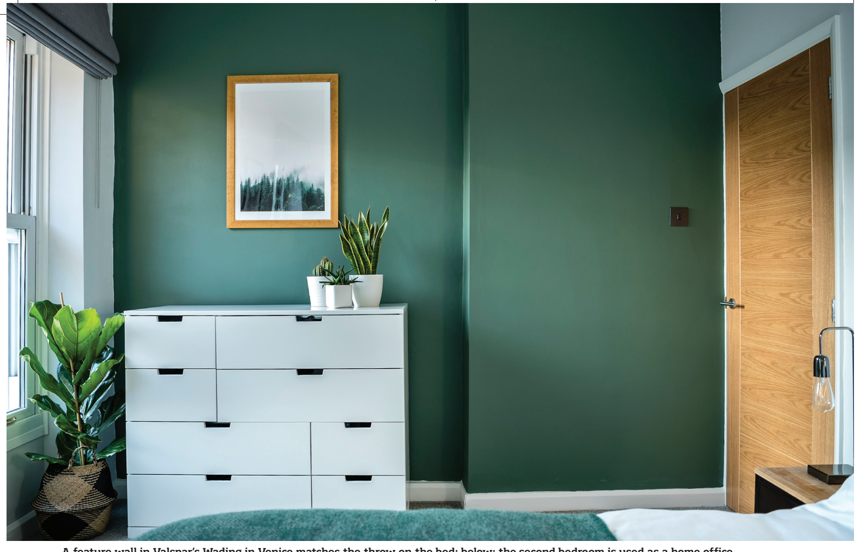
A feature wall in Valspar's Wading in Venice matches the throw on the bed; below: the second bedroom is used as a home office