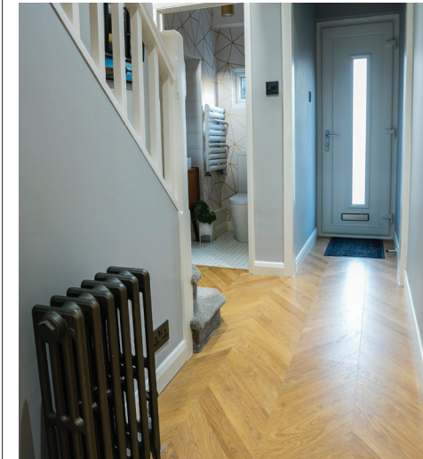
Cast iron radiators reflect the house's Victorian history; below: Amelia added hairpin legs to a G Plan unit, giving it a more contemporary look