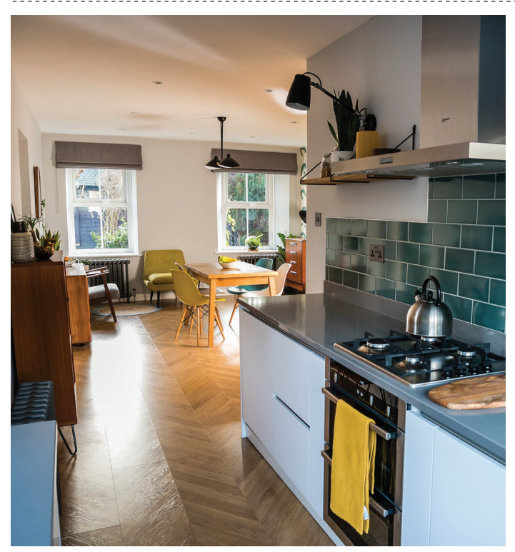
The Häcker kitchen was supplied by Marshall Mason in Penrith

'We've put together a combination of things we like – starting from mid-century but it's also contemporary and a bit more modern'